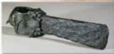
▲ Iron axe blade from Syria, 1300s B.C.

Hittite charioteers swept across the battlefield in thick lines, wielding lances, axes, and bows and arrows.