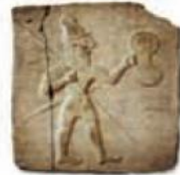
▲ A Hittite warrior

Technological advances such as the use of iron to build powerful weapons were key to the success of conquering empires. From the Hittites, other peoples picked up the use of iron and began building new tools and weapons. In the same manner, the Hittites modified a military technology invented by others—the horse-drawn chariot—to increase their own firepower capabilities.